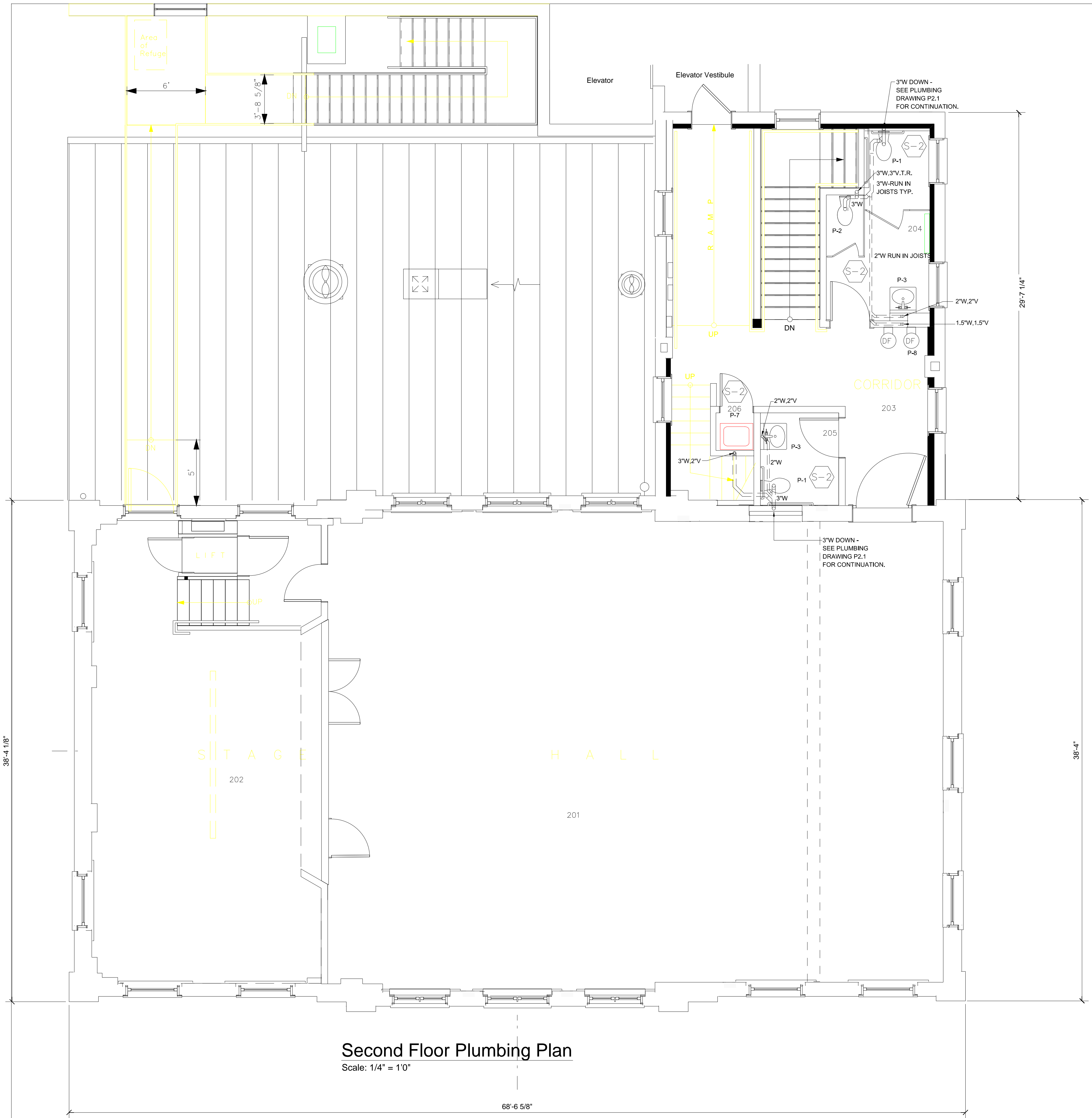
Second Floor Plumbing Plan Scale: 1/4" = 10"