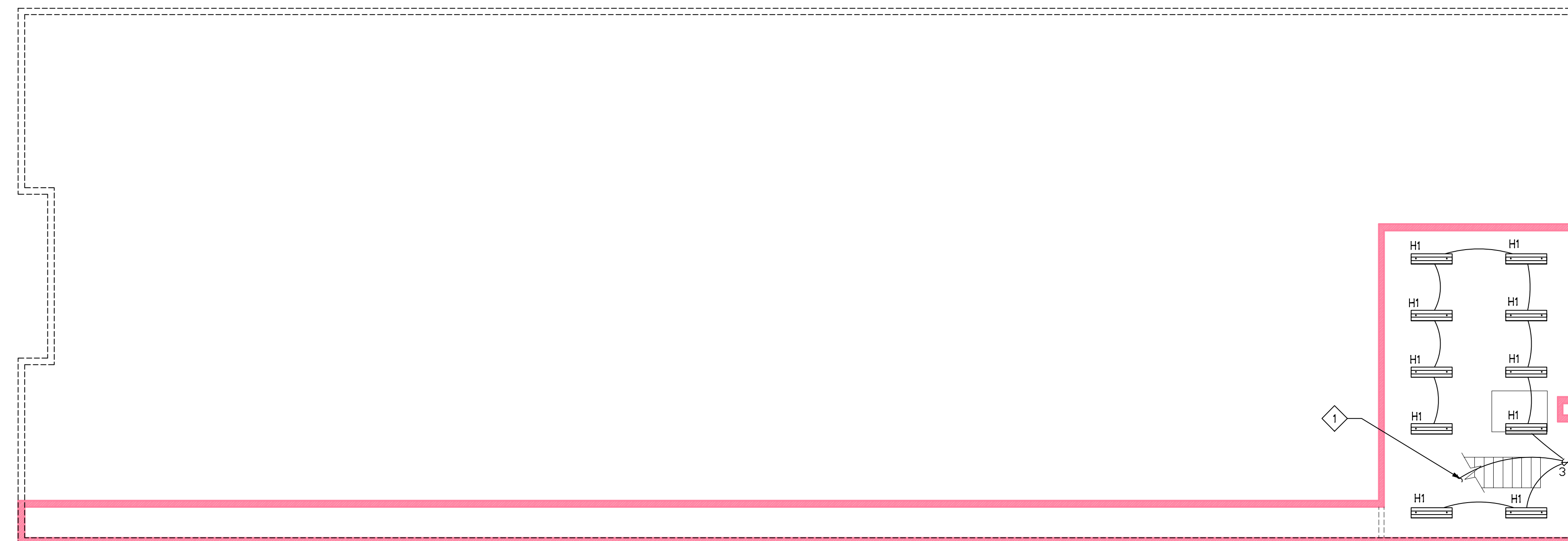
BASEMENT LIGHTING PLAN 1/8" = 1'-0"