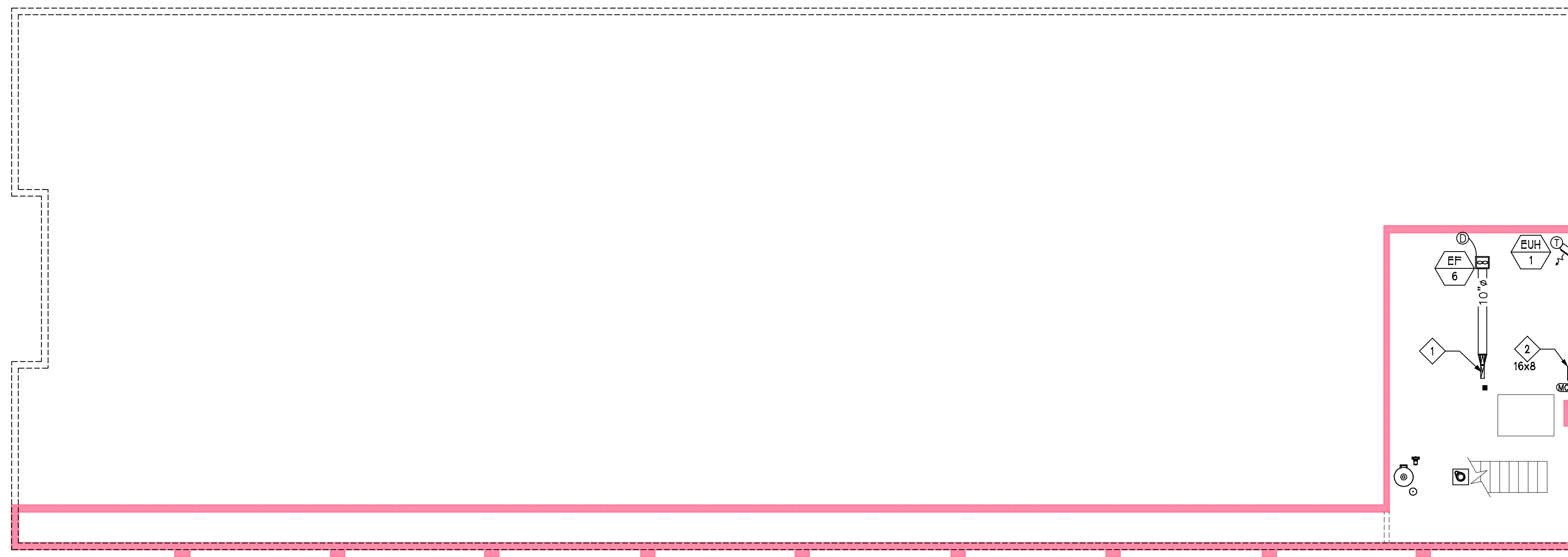
MECHANICAL BASEMENT PLAN